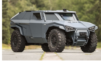
Armored Car _____