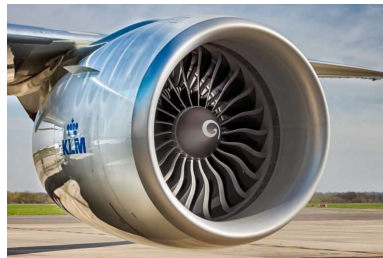
Jet Engine _____