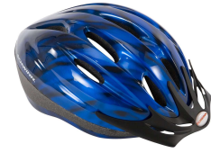
Bike Helmet _____