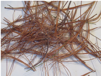
White Pine Needles